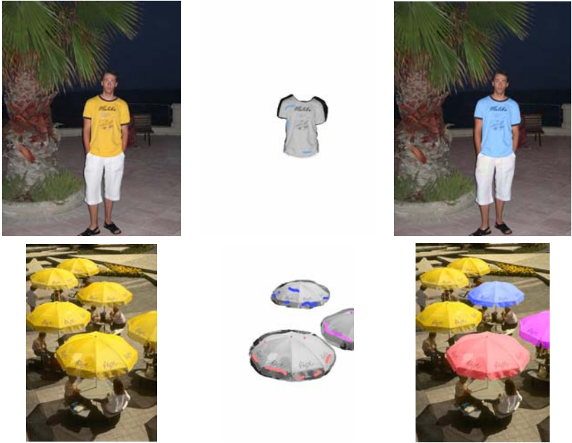
Figure 4: left column – original images, central column – white pixels are constrained to keep their original color, right column – resulting images.