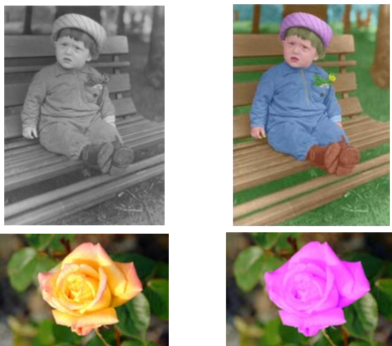
Figure 1: Examples of image colorization and recoloring by our algorithm.

Colorization is a computer-assisted process of adding color to a monochrome image or movie. Recoloring is a process of changing color in some part of an image or movie. Both processes are illustrated on figure 1.