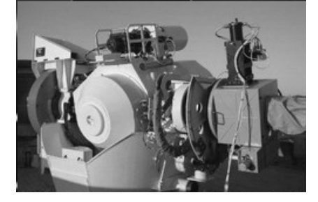
Figure 1: Russian telescope with adaptive optical system

The problem of imaging is one of the crucial problems in the ground-based observations through a turbulent atmosphere. The most effective tool for compensation of phase distortions caused by fluctuations of refractive index of atmosphere is an adaptive optical system. The adaptive optical system consists of the wave front sensor and the active adaptive mirrors compensating the phase distortion measured by the sensor. The sensor and adaptive mirrors are connected by control feedback.