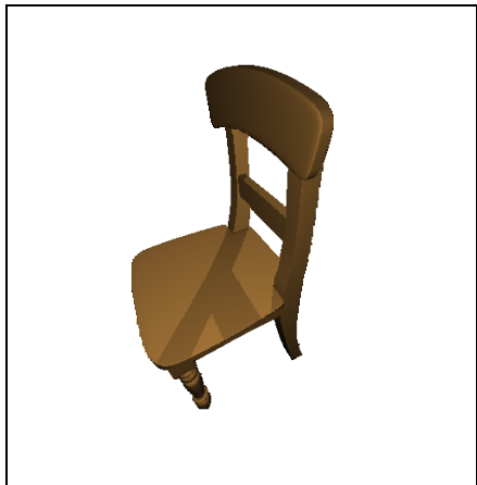
Figure 5: The wooden chair scene rendered using our approach. Note the shadow cast from a distant light source by the back of the chair.