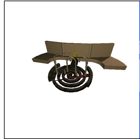
Figure 6: The palace scene.

This case study has shown that modern GPUs are suitable not only for streaming programming with short shaders, but also for writing much more complex programs which perform complex computations, such as entire ray tracing, in a single pass.