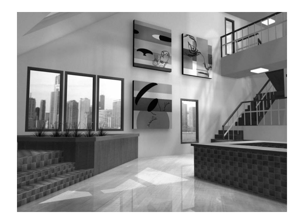
Figure 4. Interior 3D Rendering by Student

Figure 5, 6, and 7 show illustrations from other areas of the course. It was deemed important for the students to have an understanding of other areas of digital illustration and not just focus on Architectural renderings.