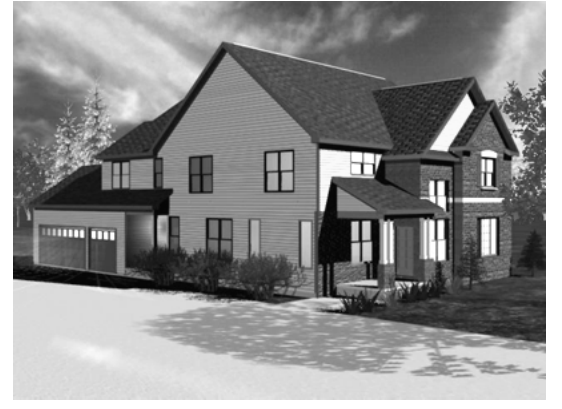
Figure 3. Exterior 3D Rendering by Student

The students complete four projects throughout the semester. These projects include a still life that must be composed and surfaced, but lighting is given; an exterior scene that requires complex materials and simple lighting; either an exterior architectural rendering, or a still life that requires all materials and lighting; and last, an architectural interior. The main goal of these projects parallels Smith and Bertolone's opinion that there is a need to generate an understanding of the observer's perspective of objects, materials and lighting within the scene [Smith [6]. The closer the camera, the more detailed the illustration. In the last two projects, the students are given several scenes to choose from, then after selecting one, they create a camera, create and apply materials, and then apply a lighting scheme to produce a digital illustration. Figures 3 and 4 show examples of exterior and interior architectural illustrations composed and rendered by students from 3D models.