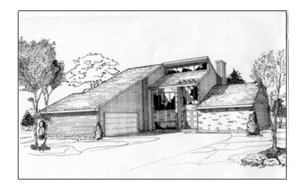
Figure 2: Pen & Ink Rendering- Traditional

The digital illustrations of the architectural perspectives were initially accomplished in Photoshop. The vector perspectives were transferred into Photoshop, placed on an outline layer, and rendered on multiple layers according to material type. The students were given information about construction materials, such as brick, vinyl siding, stucco, shingles, window types, doors, and proportional sizes to complete the illustrations. They were also given procedures for creating the materials as graphic images in Photoshop to apply to the perspective. The entire rendering of the structure was not a problem for the students. The casting of shadows was the biggest hurdle the students encountered. They did not understand the relationship between the shades & shadows worksheets they were working on and how to cast the shadows in the illustration. It was clear after two semesters that although Photoshop materials were highly useful, student knowledge and ability to create shade and shadow correctly on 2D digital illustrations was very ineffective. Students were still failing to comprehend and correctly visualize the fundamental three-dimensional relationships between building structures, sunlight, shade and shadow. Since the course had to evolve into a digital medium and forego the traditional process, it was time for a truly monumental change for the course.