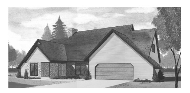
Figure 1: Acrylic Paint Illus. - Traditional

into a digital one. The acrylic paintings were finally retired and the color architectural illustrations were generated using rasterimaging software. Examples of traditional acrylic painting as well as pen and ink architectural illustrations are shown in figures 1 & 2.