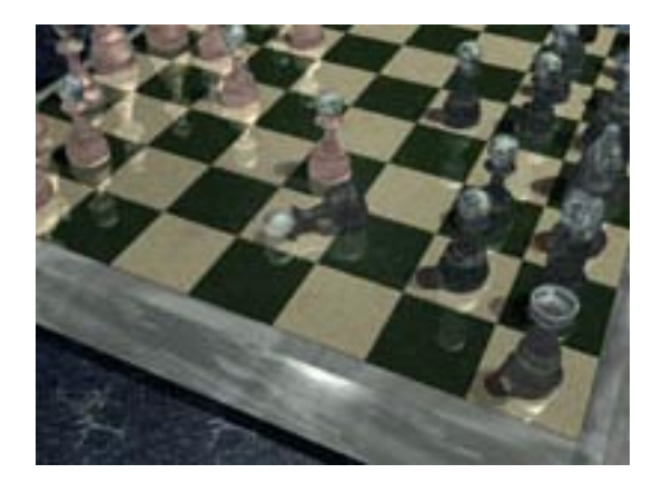
Figure 6: Digital Rendering- Just Getting Started in Digital Rendering Course