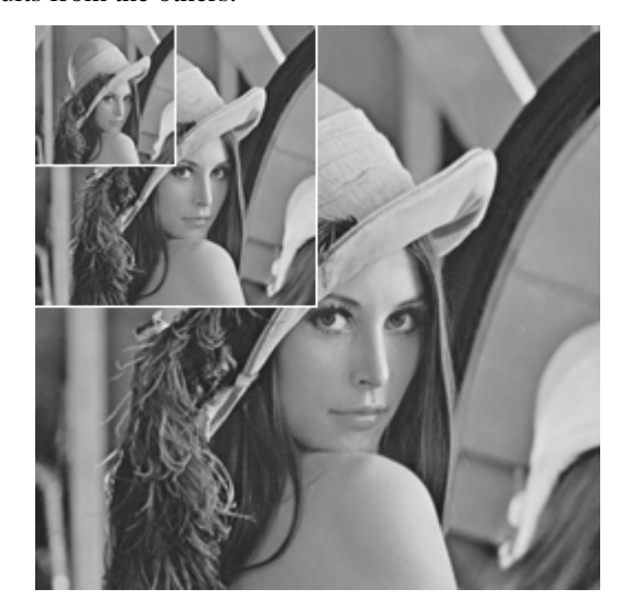
Fig. 1. 3 resolution levels of image.

experiments with one of these variants, we expect similar results from the others.