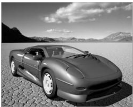
Figure 3: Photomontage of a car

Background pixels are drawn as is. Pixels, corresponding to reconstructed objects are modified: brightness depends on ratio of total and direct illumination of proper point on the scene. Thus, correct shadows and reflections are provided for source image pixels. Mounted 3D object is rendered as usually, background image and reconstructed objects are reflected by specular surfaces.