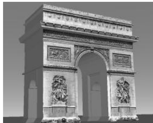
Figure 2: Textured model

It is possible to assign a color texture, taken directly from images, to object faces. Textures can be assigned automatically - by selection an image with the best visibility, or manually - by picking proper face on a desired image. Perspective texture mapping is used for internal visualization of a model - image is transformed from the real camera view to the current view of the model. Color of the face is calculated as the mean color of the face texture pixels.