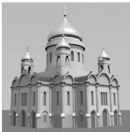
Figure 4: Cathedral of the Savior, Moscow

Model of the Cathedral of the Savior consists from 1053 blocks, it has 6478 original parameters which are reduced to 93 free parameters. Model has a lot of symmetric parts, which were created by copying of the whole branches of blocks. Image on the figure below is rendered by Inspirer without textures.