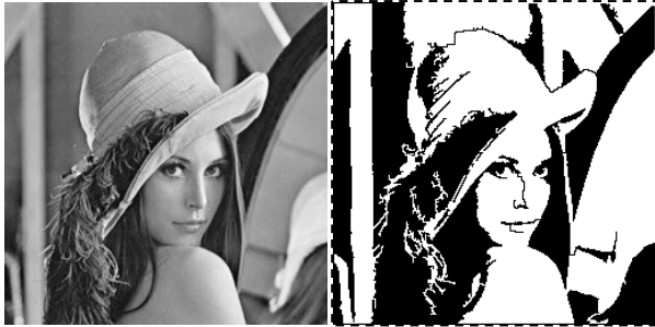
Figure 2: Nearly optimal piecewise constant image approximation with two segments. The original image is shown on the left and its contrasted approximation is shown on the right.

reliable computation of non optimal, but only optimized image approximations is further discussed (Fig. 2).