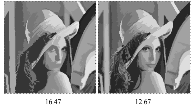
Figure 4: Optimized image approximations with 99 segments.

Based on our first results on optimized approximations obtaining for standard and other images followed by their improvement, we venture to assert that for an image approximations which are equalized in segment number, the increase in the value of the standard deviation as a rule is accompanied with the smearing of some visually observed objects (Fig. 4).